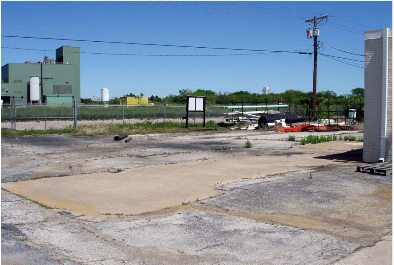
Storage Area in Back